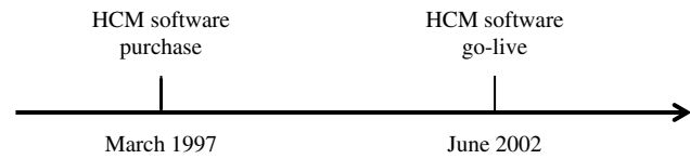
Figure 1 Timeline of HCM Adoption of a Firm in the Manufacturing Industry

may be endogenous. Although we hypothesize that HCM adoption drives firm performance, the reverse is also possible—firms may choose to adopt HCM when they perform well or experience exogenous shocks to productivity. To distinguish these explanations, we separately measure the decision to invest and the actual investment itself.